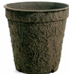
15X16RD 7.97 gal/30.2 L 14 per case