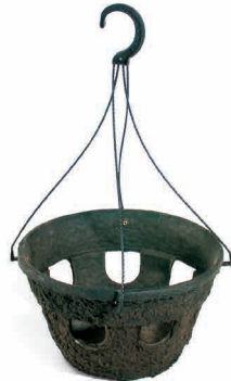
12 Cascade Basket 2.34 gal/8.87 L 22 per case