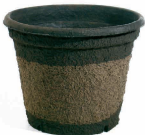
18X16RD 12.15 gal/46.0 L 10 per case