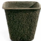
11X11SQ 3.77 gal/14.3 L 36 per case