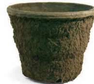
12 Traditional 3.30 gal/12.5 L 16 per case