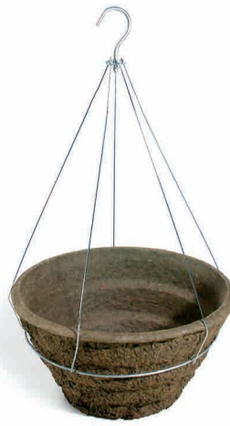
16X8 Garden Basket 4.43 gal/16.8 L 20 per case