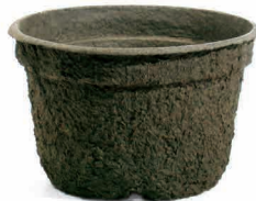
15X10RD 4.28 gal/16.2 L 20 per case