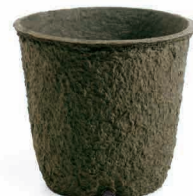
12X11RD 3.40 gal/12.9 L 32 per case