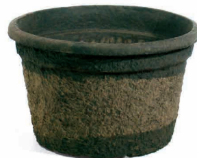
18X12RD 9.90 gal/37.5 L 12 per case