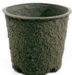
9X9RD 1.80 gal/6.83 L 40 per case