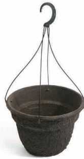
10XLRD Basket 1.59 gal/6.05 L 22 per case