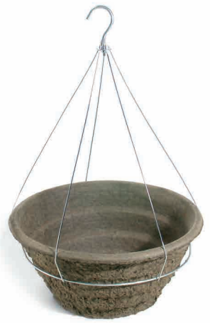
18X10 Garden Basket 5.99 gal/22.7 L 20 per case