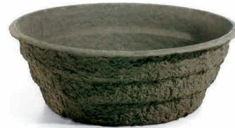
21X8RD 7.21 gal/27.3 L 16 per case

IDEAL FOR BARERoot ROSES, FRUIT TREES, SHRUBS AND FIELD DUG PLANTS