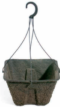
12SQ Basket 2.80 gal/10.6 L 22 per case