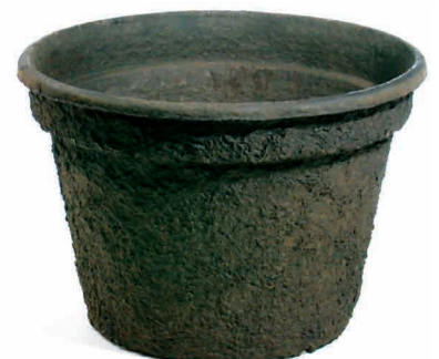
24X18RD 23.38 gal/88.5 L 10 per case