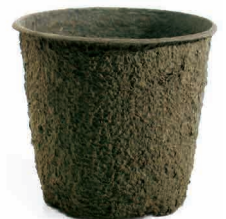
13X12RD 5.52 gal/20.9 L 28 per case