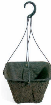
10SQ Basket 1.84 gal/6.98 L 22 per case