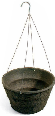
14XLRD Basket 3.96 gal/15.0 L 20 per case