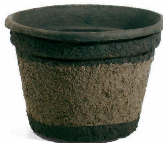
21X16RD 16.11 gal/61.0 L 8 per case