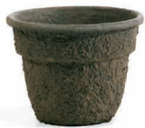
10 Bell 1.90 gal/7.2 L 16 per case