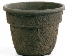
14 Bell 5.28 gal/20.0 L 16 per case