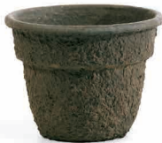
12 Bell 3.35 gal/12.7 L 16 per case