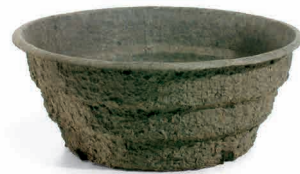
18X8RD 5.65 gal/21.4 L 20 per case