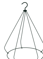
Swivel Hoop #16 #18