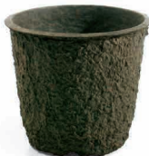
10X10RD 2.55 gal/9.68 L 36 per case