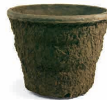
10 Traditional 2.13 gal/8.07 L 16 per case