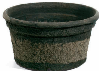
21X12RD 12.15 gal/46.0 L 10 per case