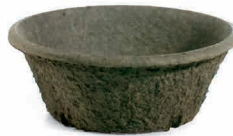
15X6RD 2.98 gal/11.3 L 40 per case