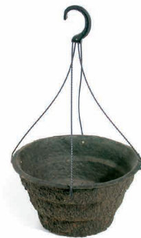
12RD Basket 2.09 gal/7.93 L 22 per case