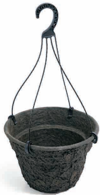
12XLRD-II Basket 2.69 gal/10.2 L 22 per case