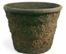
14 Traditional 5.20 gal/19.7 L 16 per case