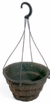
10RD Basket 1.34 gal/5.10 L 22 per case