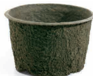
12X8RD 2.74 gal/10.4 L 40 per case