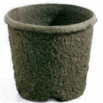
8X8RD 1.62 gal/6.14 L 40 per case