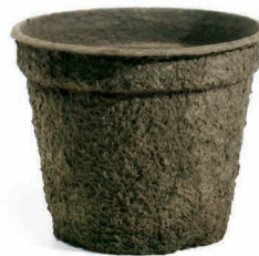
15X13RD 6.55 gal/24.8 L 16 per case