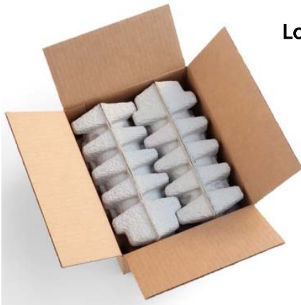
Put 2 or more shippers into a single box and they index together, saving space without sacrificing protection.