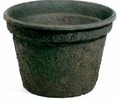
24X18RD 23.38 gal/88.5 L 10 per case