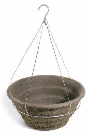
18X10 Garden Basket 5.99 gal/22.7 L 20 per case