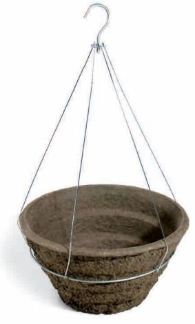
16X8 Garden Basket 4.43 gal/16.8 L 20 per case