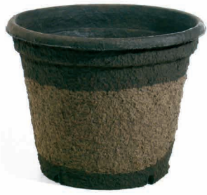
18X16RD 12.15 gal/46.0 L 10 per case