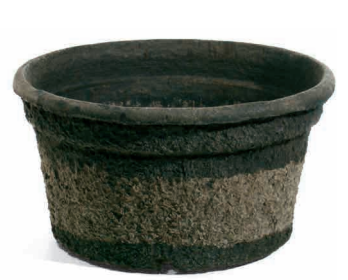
21X12RD 12.15 gal/46.0 L 10 per case