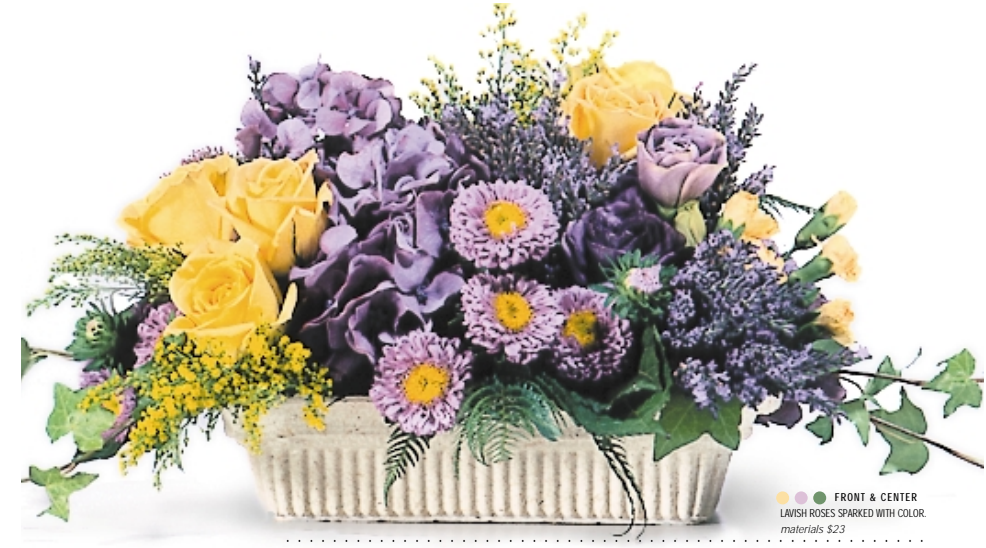
FRONT & CENTER LUSH ROSES SPARKED WITH COLOR. materials $23