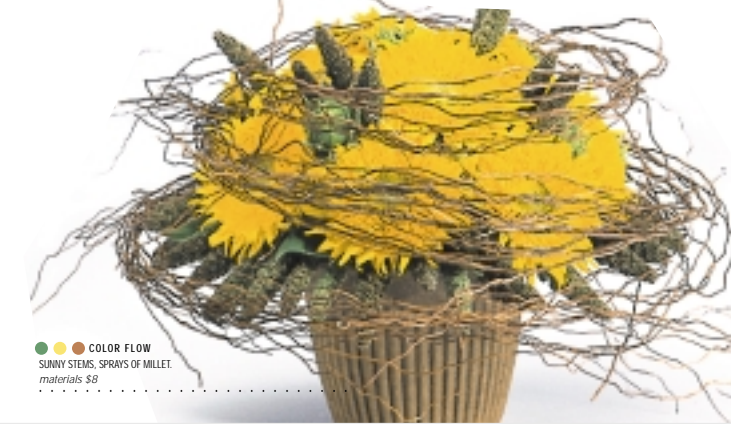
COLOR FLOW SUNNY STEMS, SPRAYS OF MILLET. materials $8