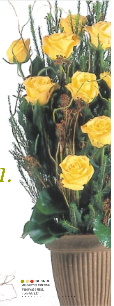
ONE DOZEN YELLOW ROSES WRAPPED IN WILLOW AND GREENS. materials $22