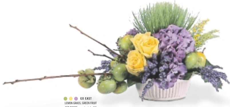
GO EAST LEMON GRASS, GREEN FRUIT AND ROSES. materials $8