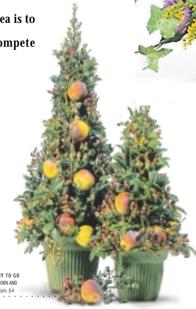
TOPIARY TO GO TWINED BERRY, ACORN AND FAUX APPLES. materials $4