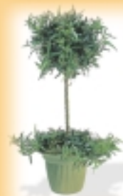
ReCreations containers lend a natural elegance to topiary...