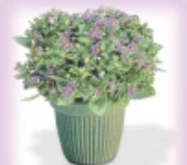
... and inspire new creativity for quick and easy bouquets.