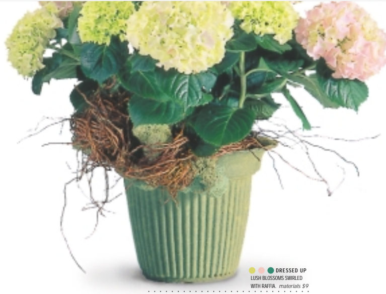
DRESSED UP LUSH BLOSSOMS SWIRLED WITH RAFFIA. materials $9