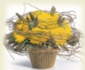
...give plants a fresh, saleable look without foil or plastic...